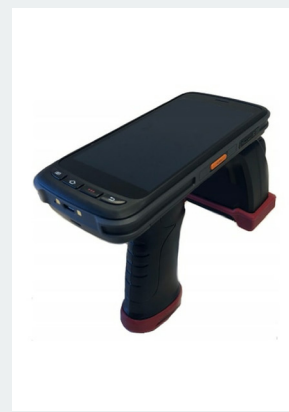
Alien Technology H460