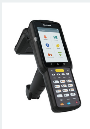
Zebra MC3330xR and MC3390xR